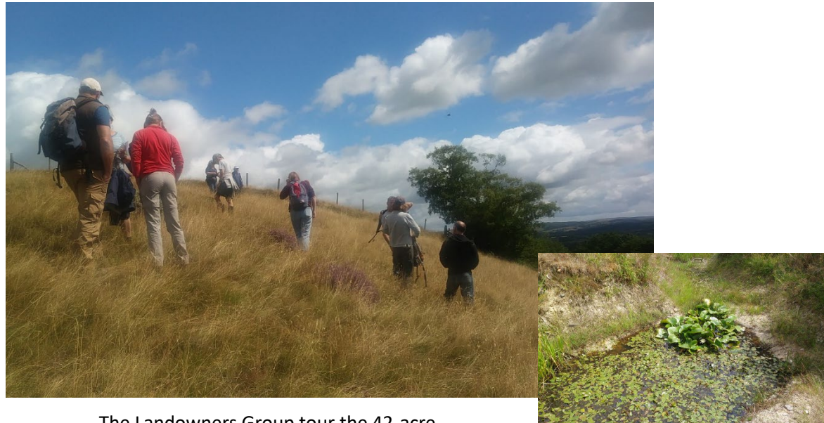
The Landowners Group tour the 42-acre farm in Llysdinam.