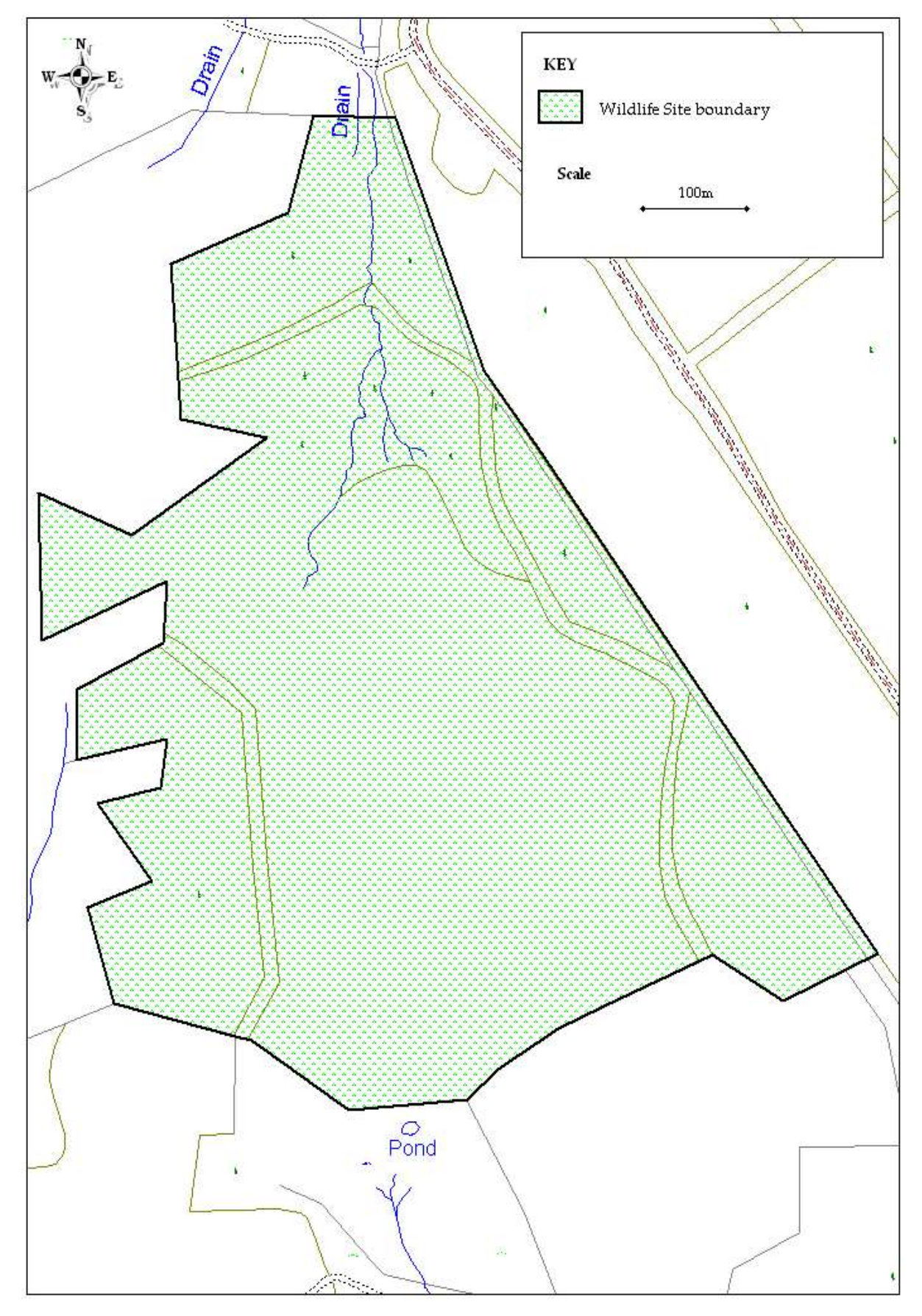
Cors Porffor boundary map