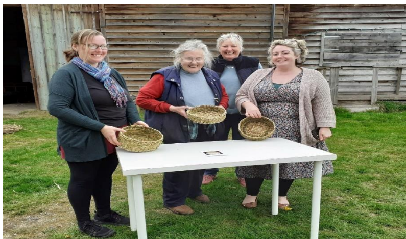
Rush Baskets made as part of the project at the Willow Globe, Radnorshire Wildlife Trust

How the arts can drive the potential to increase nature-based tourism around rhôs pasture and its associated habitats was only part of the brief and further work specifically on what has already been successful and what both the local community and visitors could benefit from may need further consideration. Particularly if additional funding is sought as a case for investment, in terms of the need and audience development potential, including what people would be prepared to pay and how it could be sustained in the long-term. There is a case to pilot and evaluate some targeted activity to ascertain impact potential.