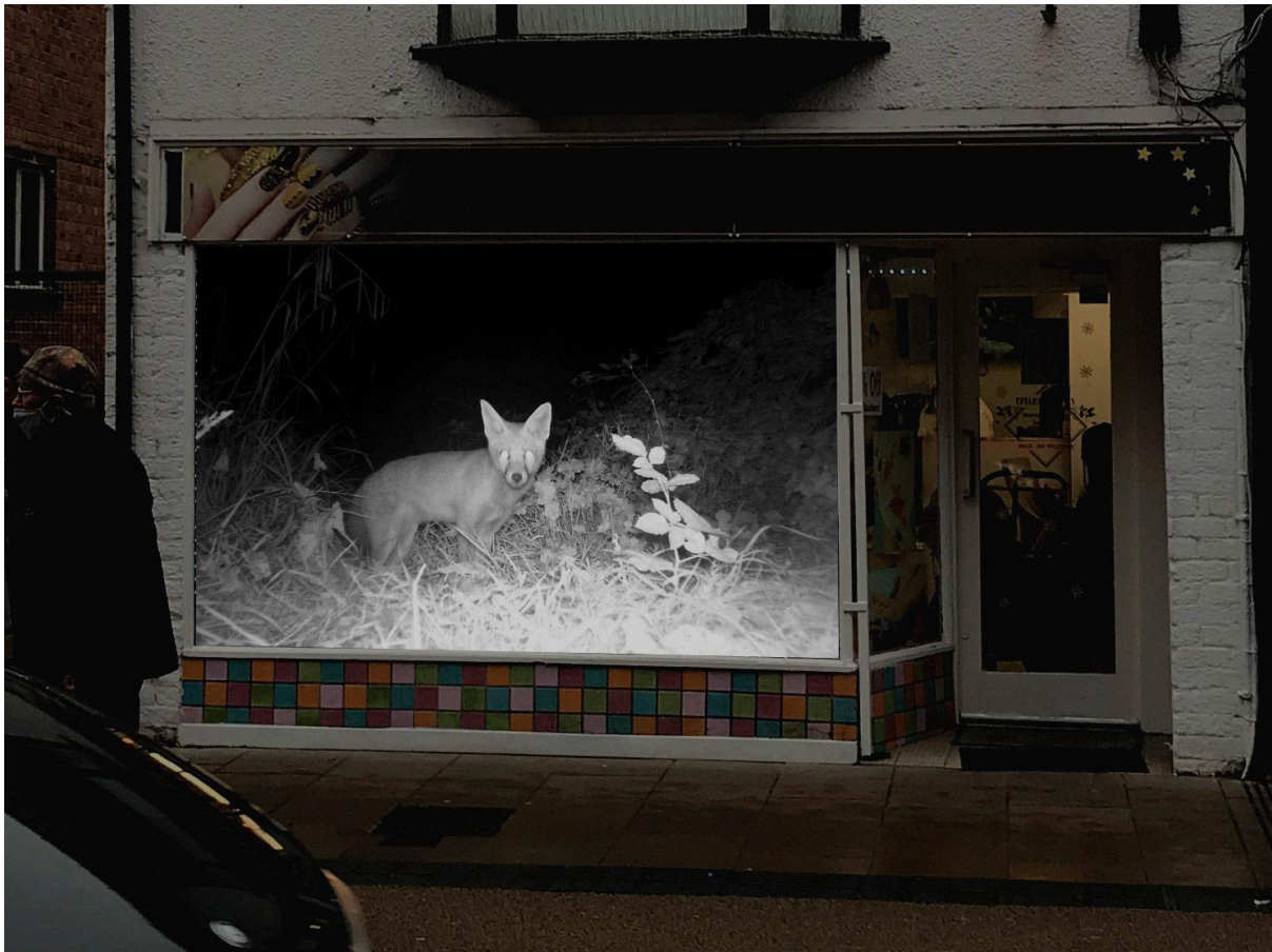
Shop—front-night-camera-animal, Jack Brown

Artist Jack Brown worked with Cheshire wildlife trust, collecting night camera footage of local wild animals. The footage captures a glimpse of foxes, badgers, mice, hedgehogs, deer, and beavers. His work looks at the overlooked, things that should be given more than a passing glance, moments that would benefit from magnification. https://wildrumpus.org.uk/shop-front-night-camera-animal-jack-brown/