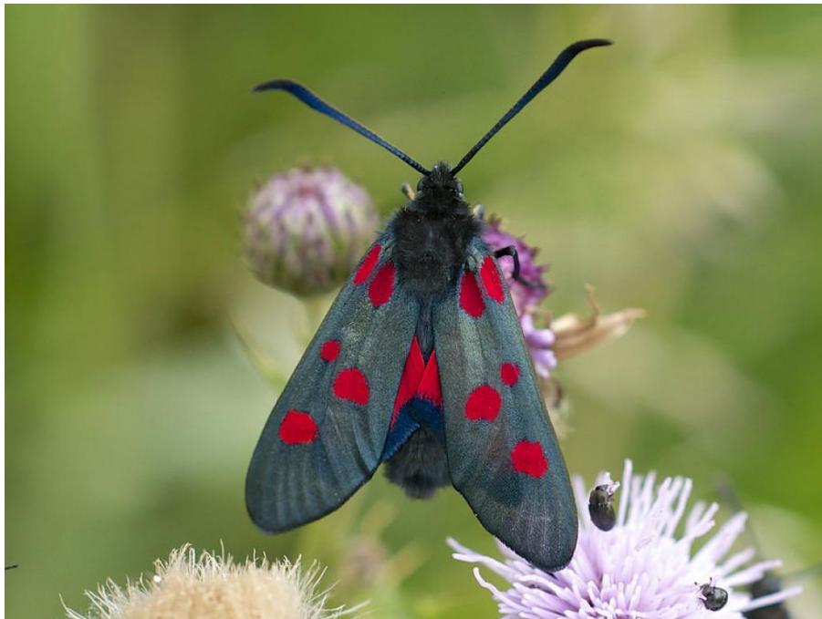
The five-spot burnet https://butterfly-conservation.org/moths/five-spot-burnet

With all these colourful flowering plants, it comes as no surprise that a great variety of insect life abounds, such as small pearl-bordered fritillary butterfly (foodplant the marsh violet), dark green fritillary, white barred and hornet clearwing, Devon carpet, five-spot burnet, drinker, silver hook and antler moths and four-spotted orb-web spider (Knight, 2022, pers. Comm.).