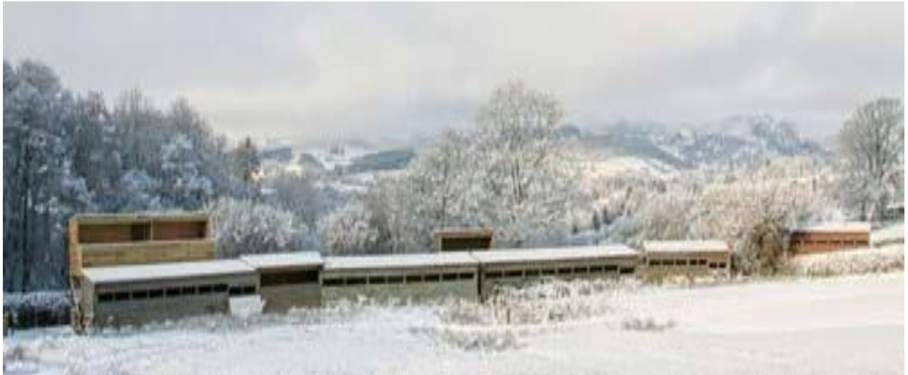
The Tower Hide at Gigrin Farm for watching kite feeding.

Kite Feeding at Gigrin Farm is a big draw for visitors and is often noted in accommodation guest books as a memorable and spectacular wildlife experience. The farm's Red Kite Centre is now well known throughout the world. https://www.gigrin.uk/about-gigrin-farm/