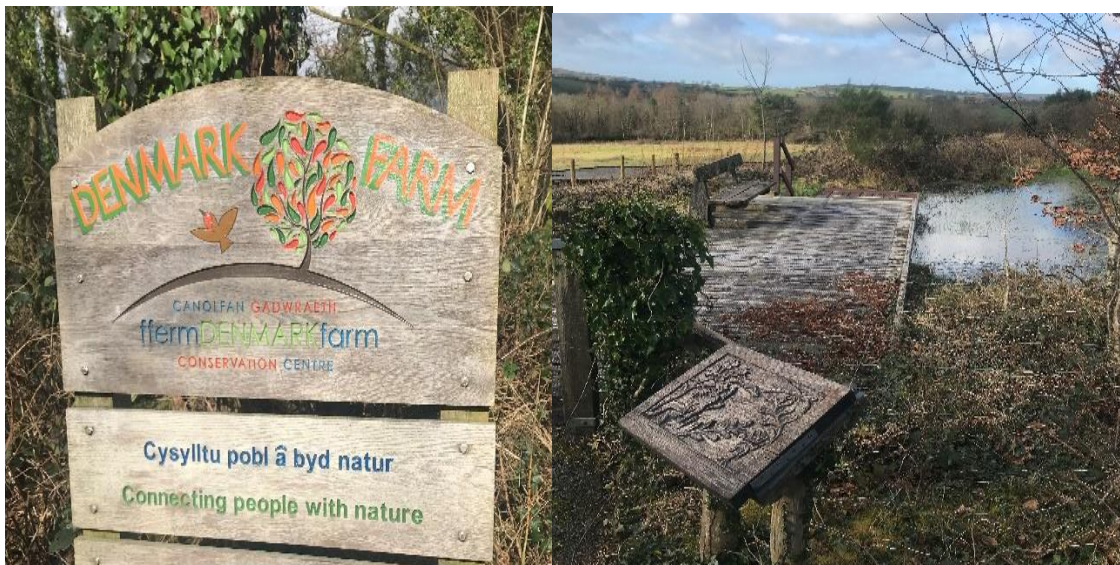
Denmark Farm Conservation Centre