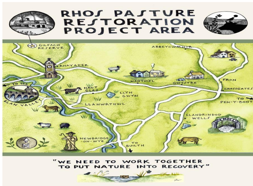
Map of Rhôs Pasture Restoration Project Study Area

The Rhôs Pasture Restoration Project is focused on the area in the northwest of Radnorshire, with many of the landowners involved in the project located around Llanwrthwl and Nant Glas near the town of Rhayader. The Rhôs Pasture Restoration Project aims to restore biodiversity and raise the socio-economic and cultural heritage value of rhôs pastures with landowners and communities.